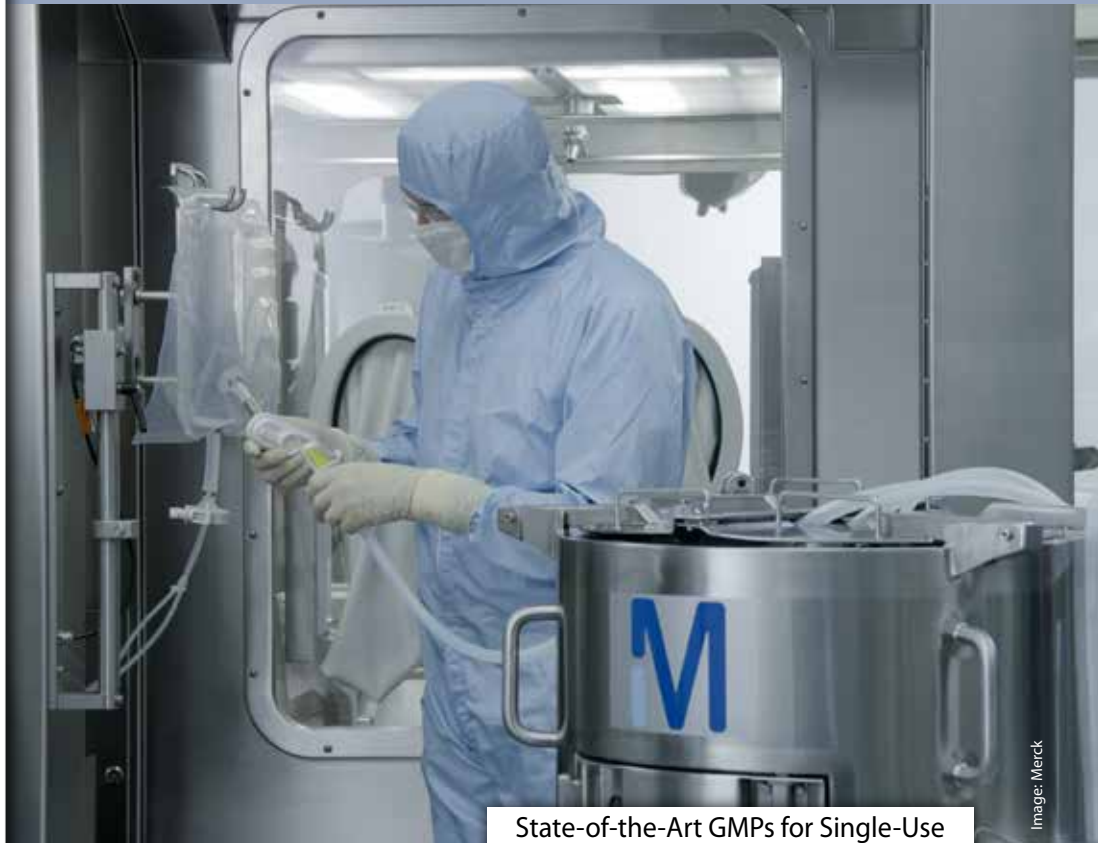
State-of-the-Art GMPs for Single-Use Systems shown by actual case studies